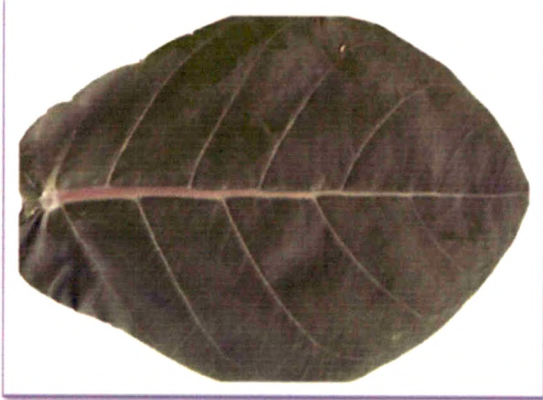
Local Name:- Akangach paat Botanical Name:- Calotropis gigantea