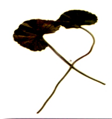
Local Name:- Bor-manimuni Botanical Name:- Centalla asiatica