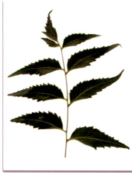
Local Name:- Neem paat Botanical Name:- Azadirachta indica