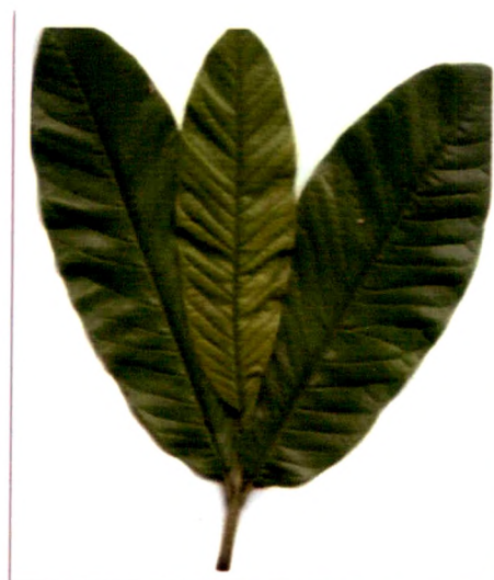
Local Name:- Modhuriaam paat Botanical Name:- Psidium guajava