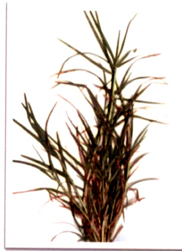
Local Name:- Dobariban Botanical Name:- Cynodon dactylon