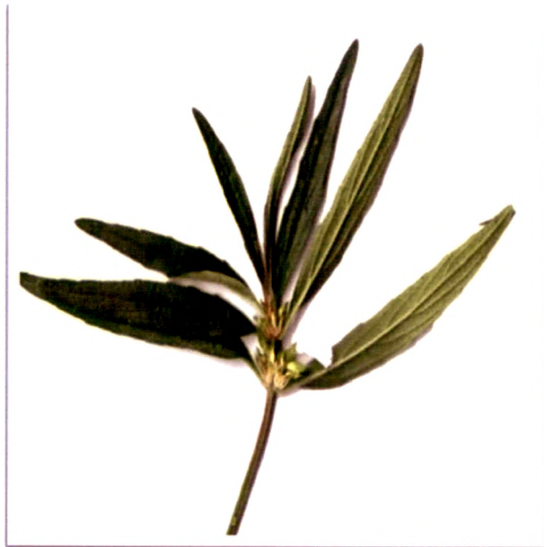
Local Name:- Doron Botanical Name:- Leucas plukenetii