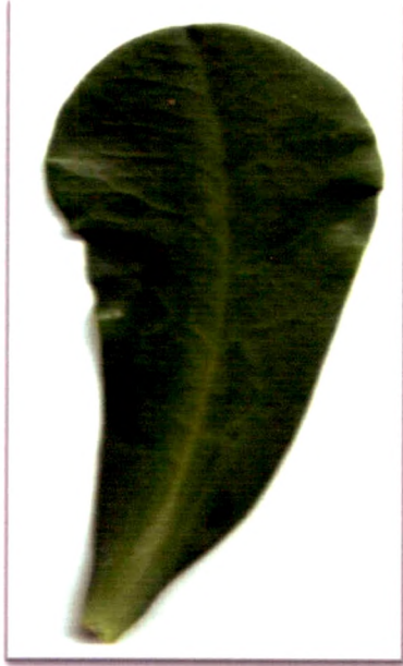
Local Name:- Siju paat Botanical Name:- Euphorbia neriifolia