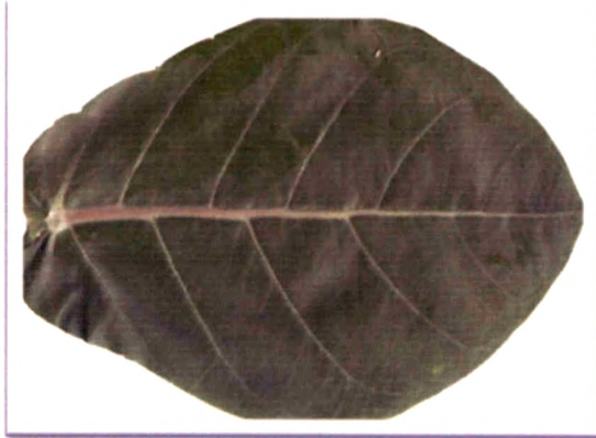
Local Name:- Akangach paat Botanical Name:- Calotropis gigantea