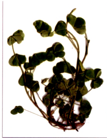
Local Name:- Tengeshi, cangeriitenga Botanical Name:- Oxalis corniculata