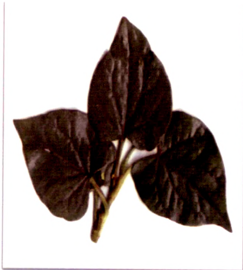
Local Name:- Mosondori Botanical Name:- Houttuynia cordata