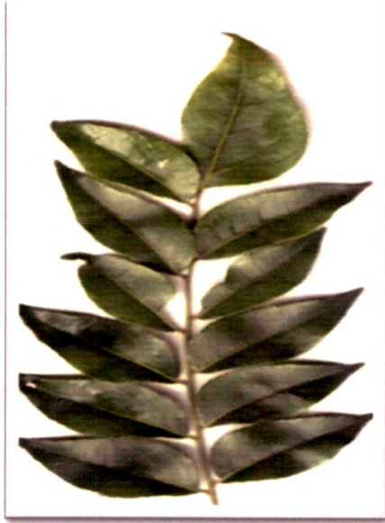
Local Name:- Narasingha Botanical Name:- Murrya koenigii