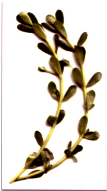
Local Name:-Brahmi Botanical Name:- Bacopa monnieri