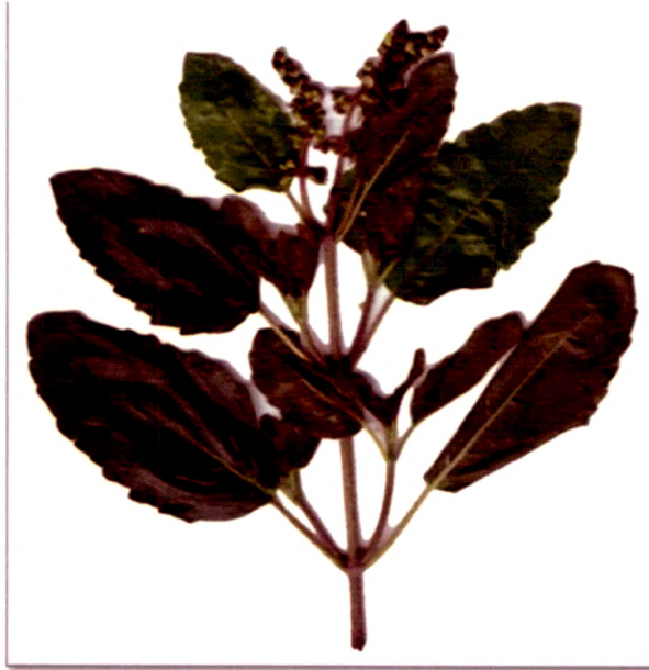
Local Name:- Tulashi Botanical Name:- Ocimum sanctum