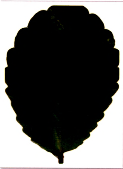
Local Name:- Patgaja Botanical Name:- Bryophyllum pinnatum