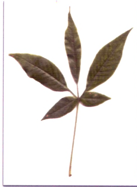
Local Name:- Pochoita Botanical Name:- Vitex negundo