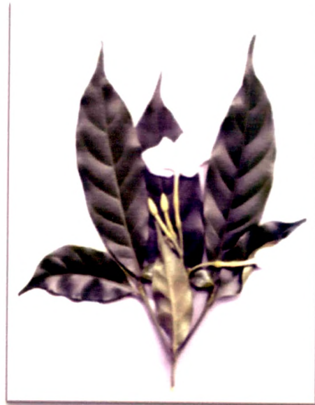
Local Name:- Kathanda Botanical Name:- Tabernaemontana divaricata