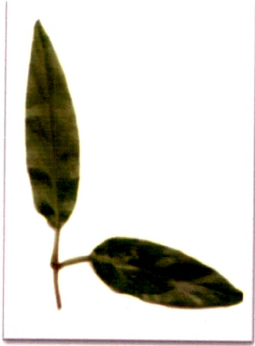
Local Name:- Bhedeli lota Botanical Name:- Paederia foetida