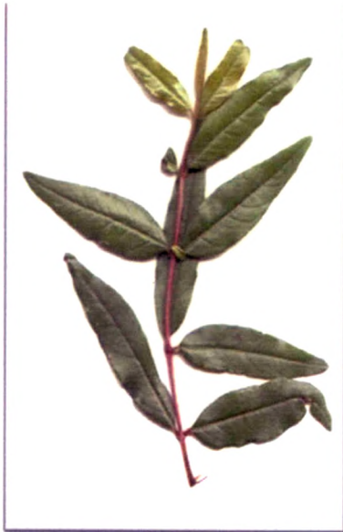
Local Name:- Dalimor paat Botanical Name:- Punica granatum