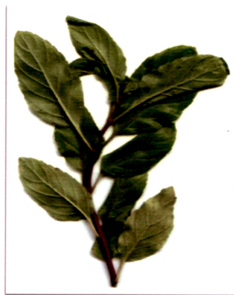
Local Name:- Padina Botanical Name:- Mentha arvensis