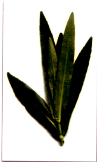
Local Name:- Helonchi Botanical Name:- Enhydra fluctuans