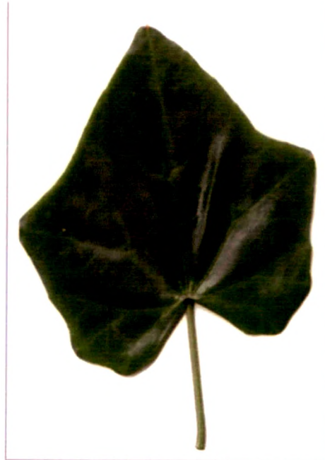
Local Name:- Kuwabhaturi Botanical Name:- Trichosanthes cucumerina