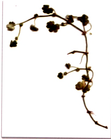
Local Name:- Soru-manimuni Botanical Name:- Hydrocotyle sibirpioides