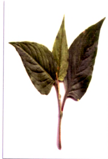
Local Name:- Madhusuleng Botanical Name:- Polygonum microcephalum